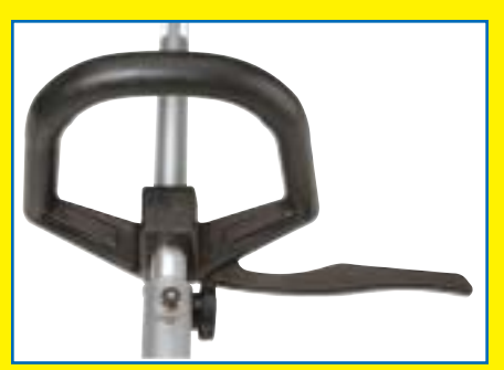
Loop handle and brace for superior user comfort.